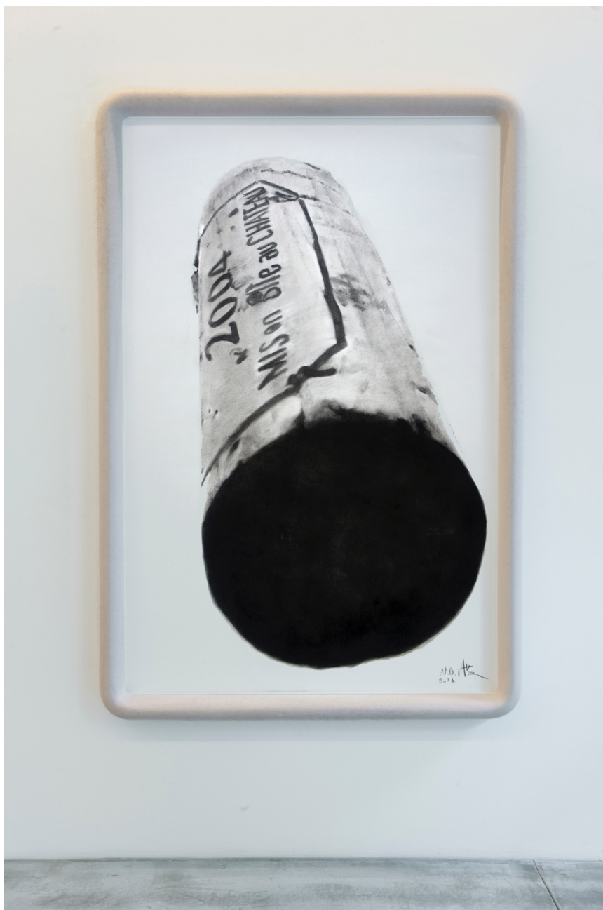
Object no. 4, 2016. Silica gel frame, charcoal on paper.