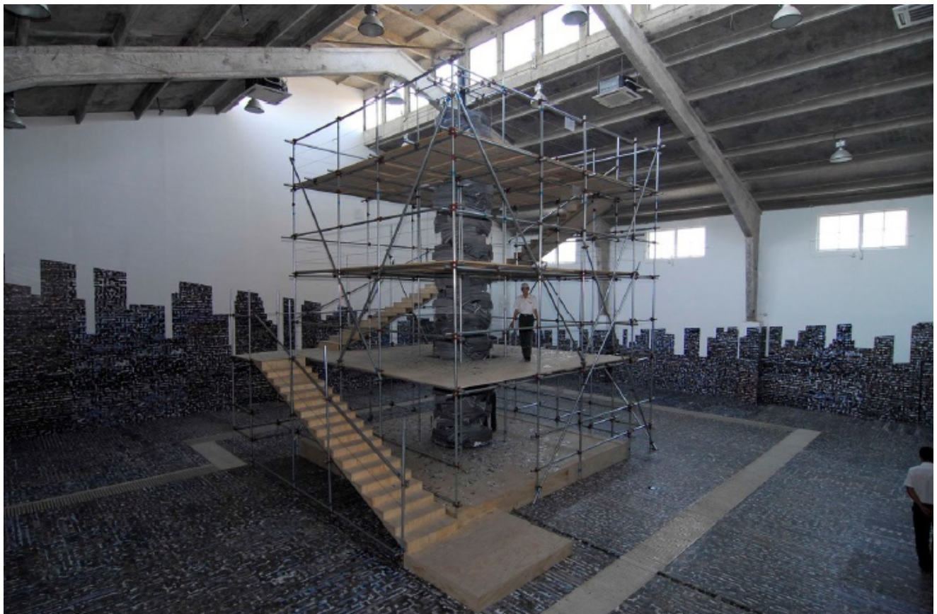
Installation “International Kebab” at Tang Contemporary Art, Beijing, 2008

In “International Kebab”, he loaded pictures that weighed 7 tons in total on a 9-meter tall turn plate. The installation looks like a Turkish Kebab which lets the audience carve out pictures from it freely, the remaining pictures would be grouped together to reform into part of the piece again, creating different dimensions for the work... Wang Du used more than 20,000 pictures of random images taken all over China to accuse the cheapness of fast food and the overloading of images, trying to give it a possible new meaning and to express his stand at the same time.”