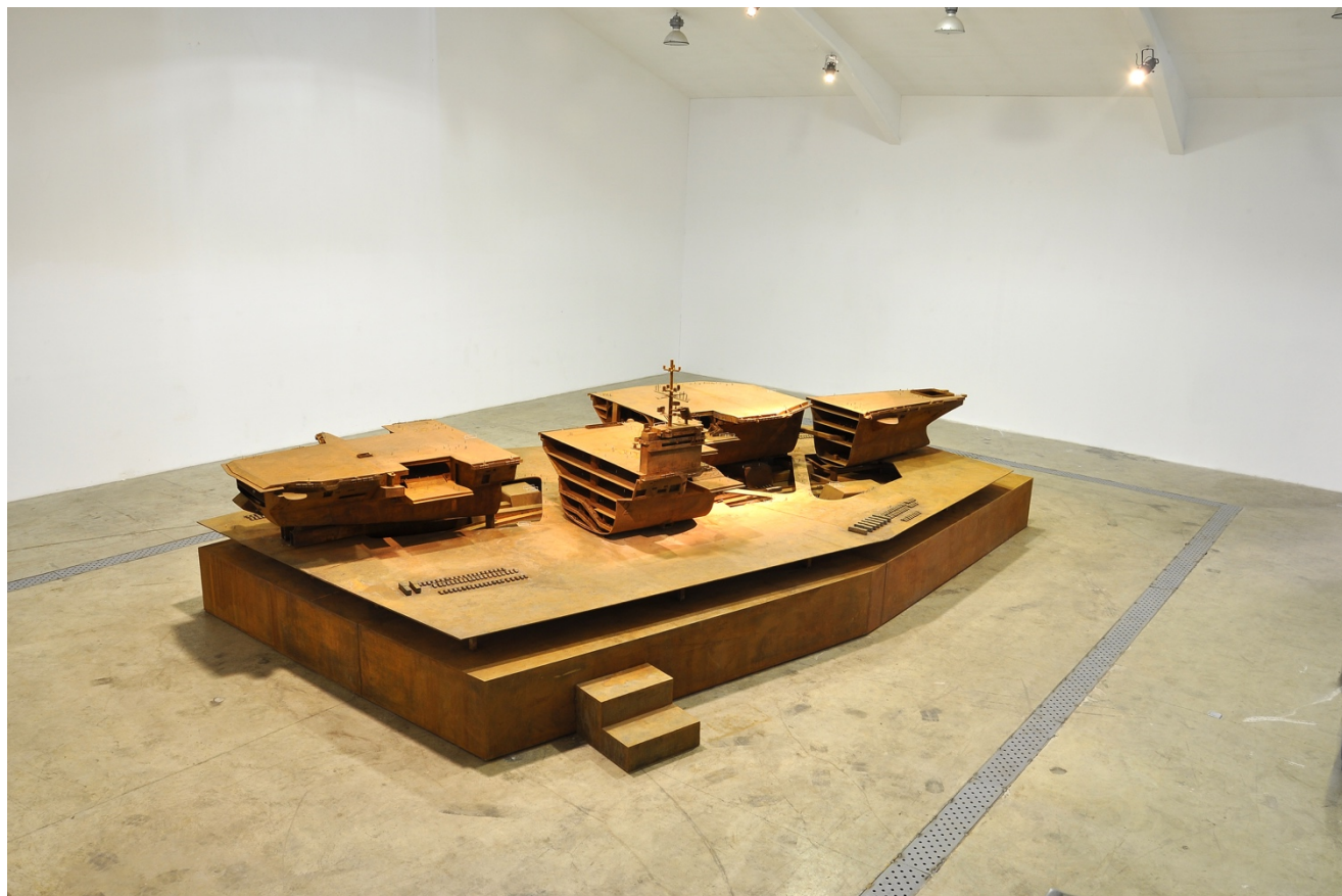
Exhibition “Musée National d’Art Contemporain” At Tang Contemporary Art, Beijing, 2012 展覽 《中國當代美術館》當代唐人藝術中心, 北京 2012

在《國際快餐》中，他用重達7噸的圖像加載與一個高達9米的大轉盤上，製成類似土耳其烤肉的裝置並讓參觀者隨意切割這些圖像。被切割下來的圖像殘屑又重新組成了作品。王度更多的認為自己是在重新定義某種已經存在的東西和重新定義某種思想而並非在創作。中國當下的環境已經在國際化和商業化的急迫要求中變成了一個“國際快餐”，所有人都想分而食之，這個環境的變化過程更是與土耳其烤肉快餐的加工做成有著異曲同工之處。王度就是要以那數萬張自己“撞進”鏡頭的中國各地的圖像來指控快餐的廉價和圖像的氾濫以求得重新定義圖像可能的法則和表達自己對當下環境的立場。