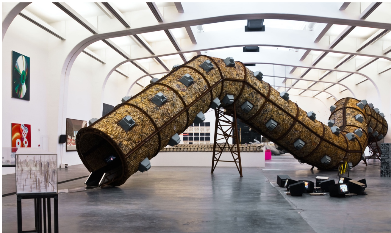
Installation work "Space Time Tunnel" at UCCA, Beijing, 2004 裝置《時空隧道》UCCA 北京，2004