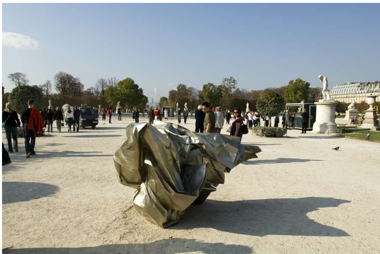
Artwork "Mode de Russe", 2007, White Bronze, 195 x 220 x 130 cm 作品《俄羅斯模式》2007，白銅，195 x 220 x 130 cm